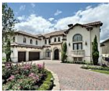
Celebrity Cribs: Which Retired NBA Baller Is Selling... Bossip