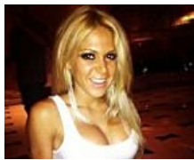
50 Hot Photos of Model Chelsey Novak Will Shock You Rant Lifestyle