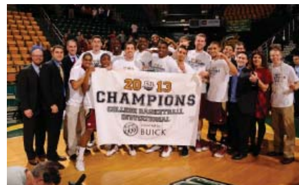
Santa Clara - 2013 Champions

As a matter of fact, the 2013 CBI saw nine games decided by six points or less, four decided by one point, and six won by the road team. This year, nine games have been decided by seven points or less, five road teams have won, and the margin of victory is 8.9 ppg.