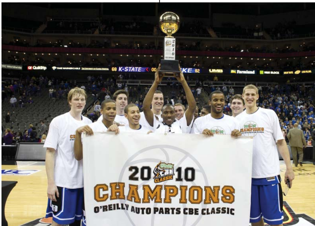
2010 CHAMPION DUKE BLUE DEVILS

2010 – In his only collegiate season and before becoming the top pick in the 2011 NBA Draft, Kyrie Irving earns MVP honors in leading top-ranked Duke to the CBE title.