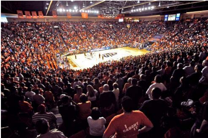
UTEP defeated Oregon State 70-63 in Game 2 of the CBI Championship Series Wednesday at the Don Haskins Center in front of a sold out crowd. This tied up the series and forced a third game to be played today at the Don Haskins Center.