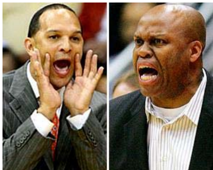
UTEP defeated Oregon State 70-63 in Game 2 of the CBI Championship Series Wednesday at the Don Haskins Center. This tied up the series and forced a third game to be played today at the Don Haskins Center.

EL PASO -- With 45 seconds remaining and the UTEP men's basketball