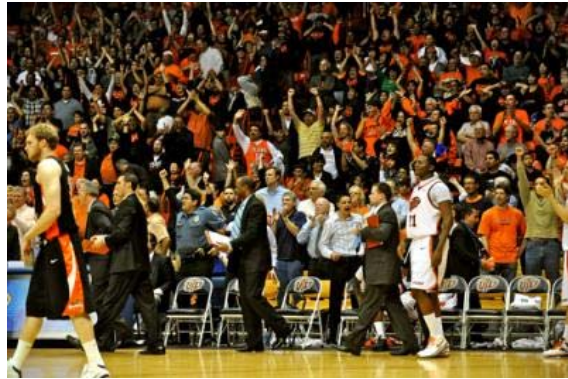
UTEP defeated Oregon State 70-63 in Game 2 of the CBI Championship Series Wednesday at the Don Haskins Center. This tied up the series and forced a third game to be played today at the Don Haskins Center.

The last time UTEP had back-to-back sellouts was in 2006, against Houston and Tulsa. UTEP made the second