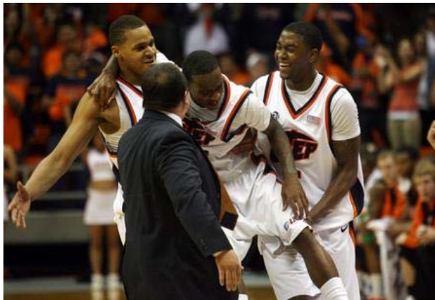
UTEP basketball players celebrate win against Oregon State in Game 2 of CBI championship series.