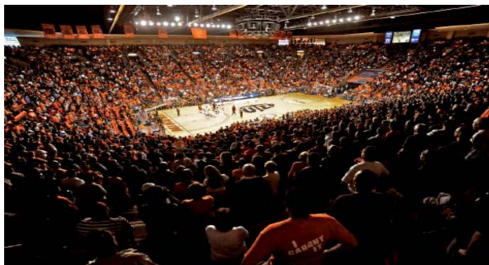
The sellout crowd of 12,000 at UTEP's Don Haskins Center at the 2009 CBI.