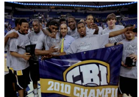
VCU, 2010 champions and 2011 Final Four participant.